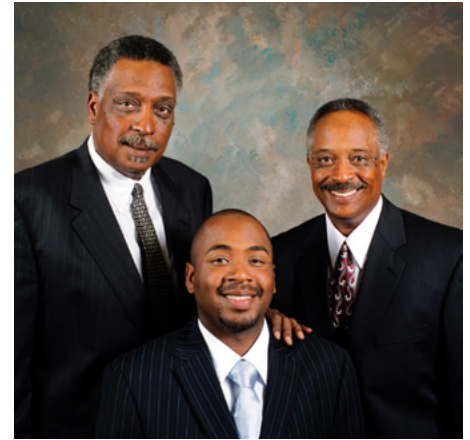
Harmon Steel, Inc. ownership group

The entire two-story portion of the building has been erected with the only one-story portion up next.